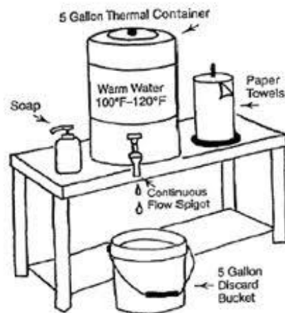
Proper Hand Wash Station