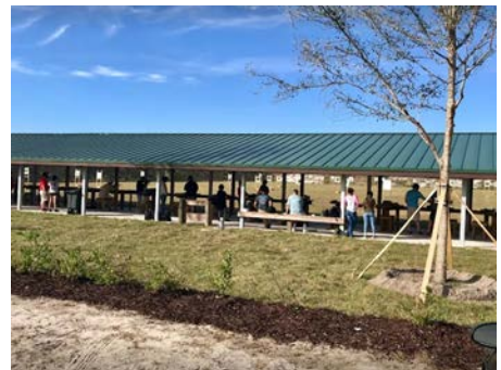
Outdoor Shooting Range