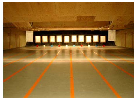
Indoor Shooting Range